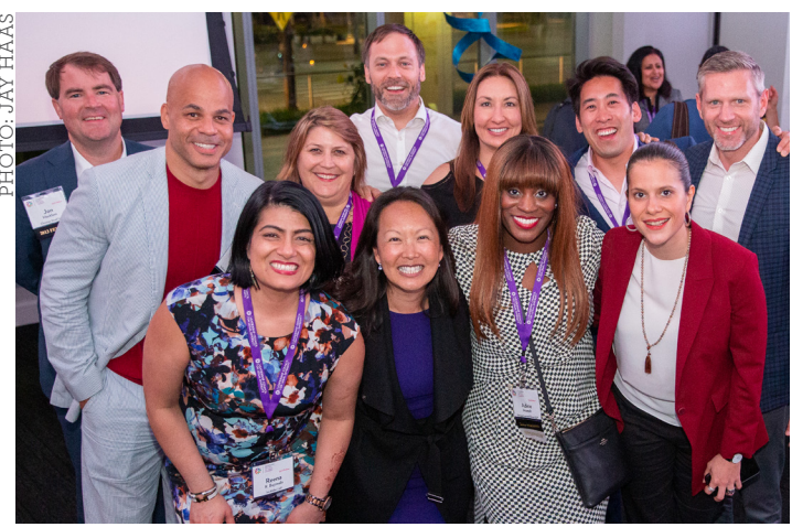
Alumni at the 2019 Leadership Symposium in Cincinnati, Ohio.

The past two Symposiums were not without challenges. Given the sheer volume of virtual events that had occurred over the prior year, the biggest challenge for 2021 was maintaining Alumni interest in attendance and engagement. Speakers and panelists were happy to attend virtually, but Alumni were understandably a bit "Zoomed out."