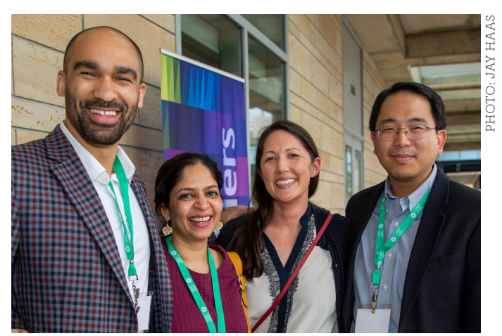
Alumni at the 2019 Leadership Symposium in Cincinnati, Ohio.

THE SUSTAINABLE PARTNERSHIP PROGRAM (SPP) was established to provide "the next steps," in terms of skill-building and networking resources, for newly elected law firm partners. It is evolving into an initiative to provide structured support in developing critical mentor and sponsor relationships for LCLD Fellows and Pathfinders beyond the year that participants spend in their respective programs.